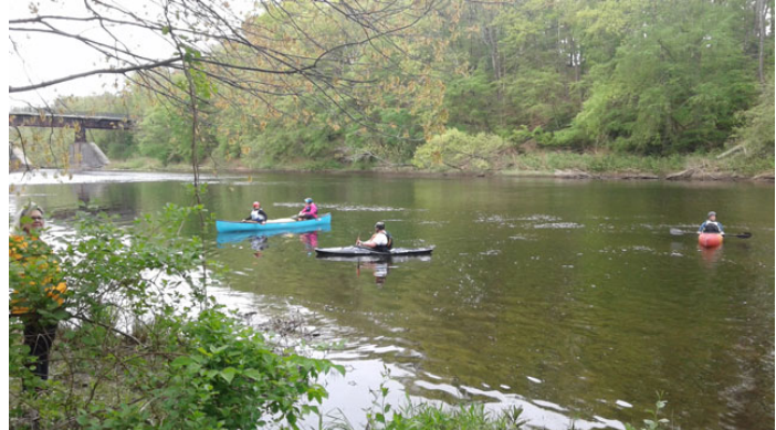
Views from the Finish Line