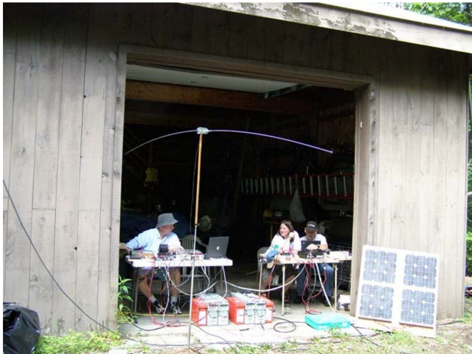
One of our solar array/battery pack set-ups.