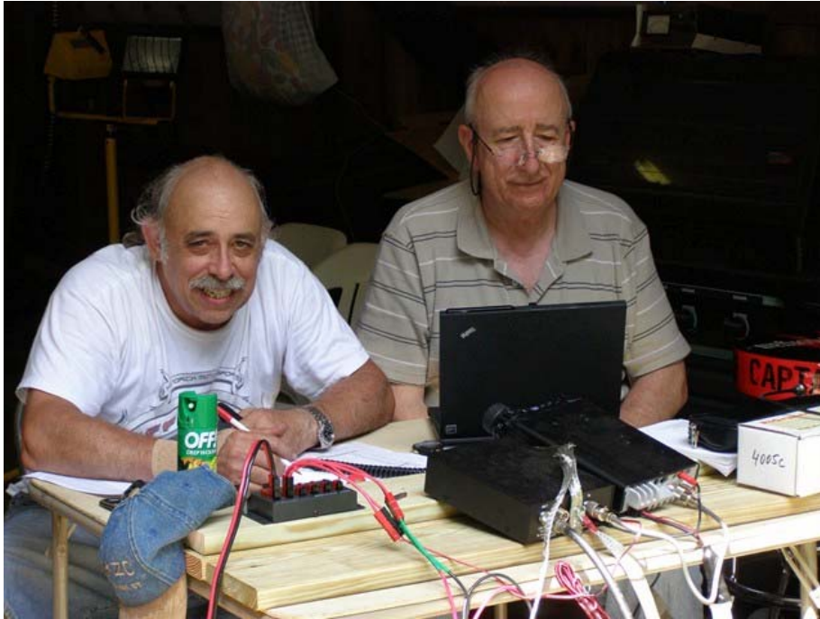
“I’m in my Happy Place” KB1KZC and K1DFS