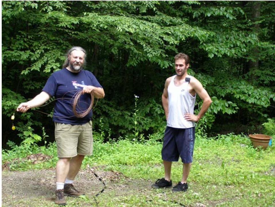
NIJGR and KB1RRR putting up another dipole.