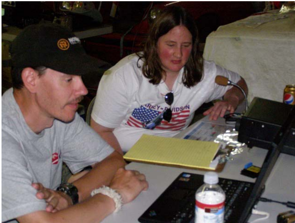
KA1NDE and KB1RRS